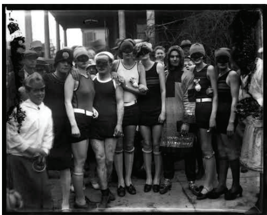
Masked Mardi Gras Goers 1925-1935