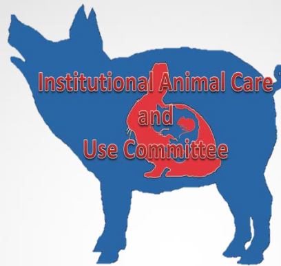
Animal Care and Use