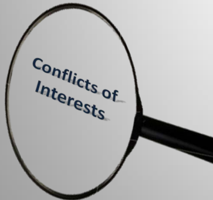
Conflict of Interest