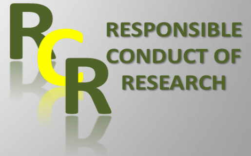
Responsible Conduct of Research